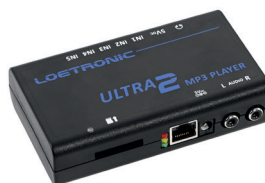
ULTRA 2 Player